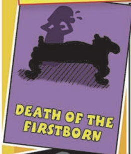
DEATH OF THE FIRSTBORN

The Gematria of the names of one of the Parshiot, Va'era (וַאֲרָא) or Bo (בּוֹ), give us a clue as to how many of the plagues appear in that Parasha. Can you work out which one it is?