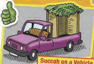
Succah on a Vehicle