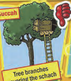
Tree branches covering the schach