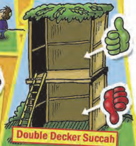
Double Decker Succah

Note: A Succah in a tree, on a camel or a boat cannot be used on Shabbat or Yom Tov , only on Chol Hamoed . A boat boarded before Shabbat or Yom Tov is permitted.