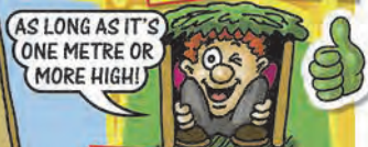
Very Small Succah