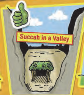
Succah in a Valley