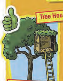
Tree House Succah