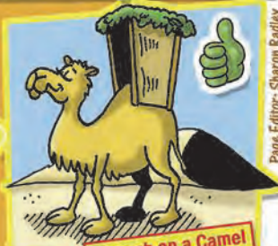
Succah on a Camel