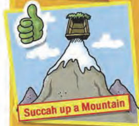
Succah up a Mountain