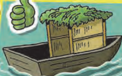
Succah in a Boat