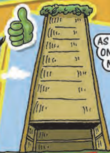
Very Tall Succah Up to 12 Metres